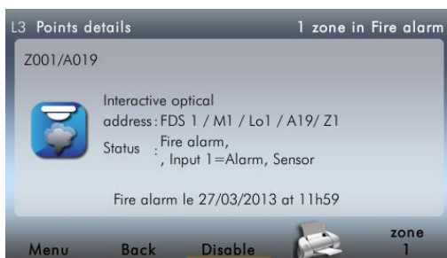
Details of a point